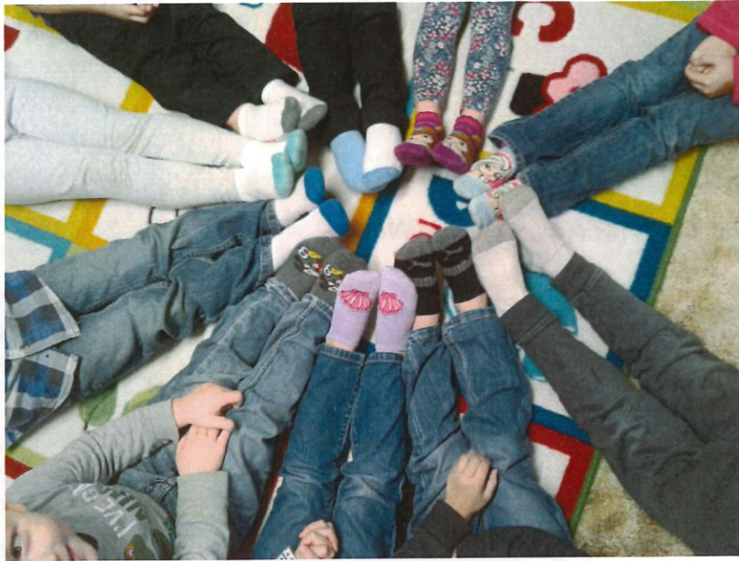
Silly Sock Day!

Some of our activities during NLSW this year!