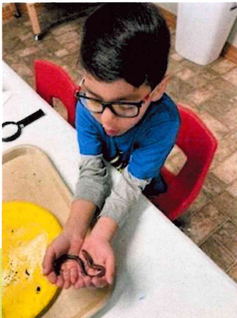
Learning about worms!