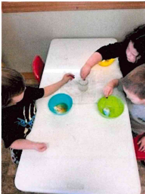
Digging for dinosaurs and hatching dinosaur eggs from baking soda and vinegar!